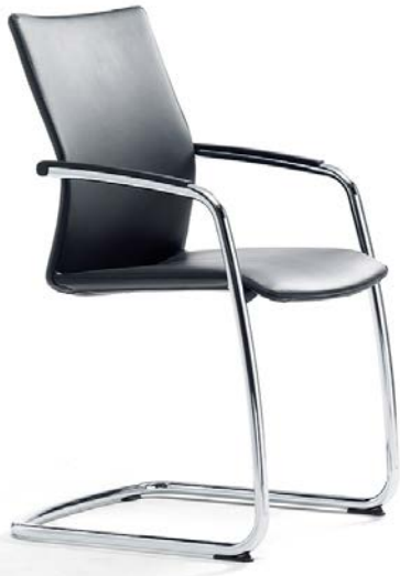
cie58, 3510, 3253, URBAN