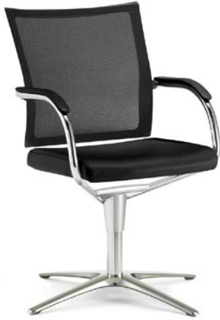
orb80, 3510, 3253, 3106, URBAN